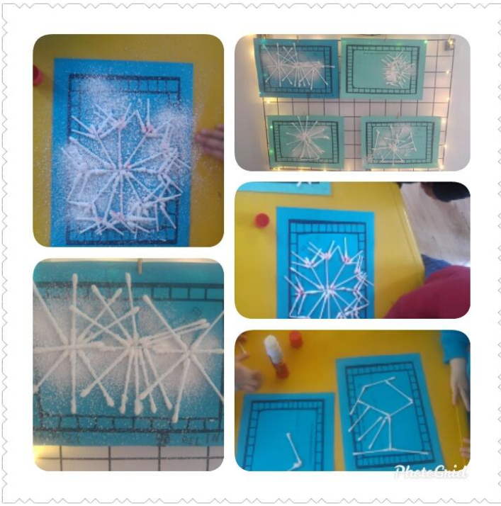
The stem study of the book “Karlı Bir Gün”