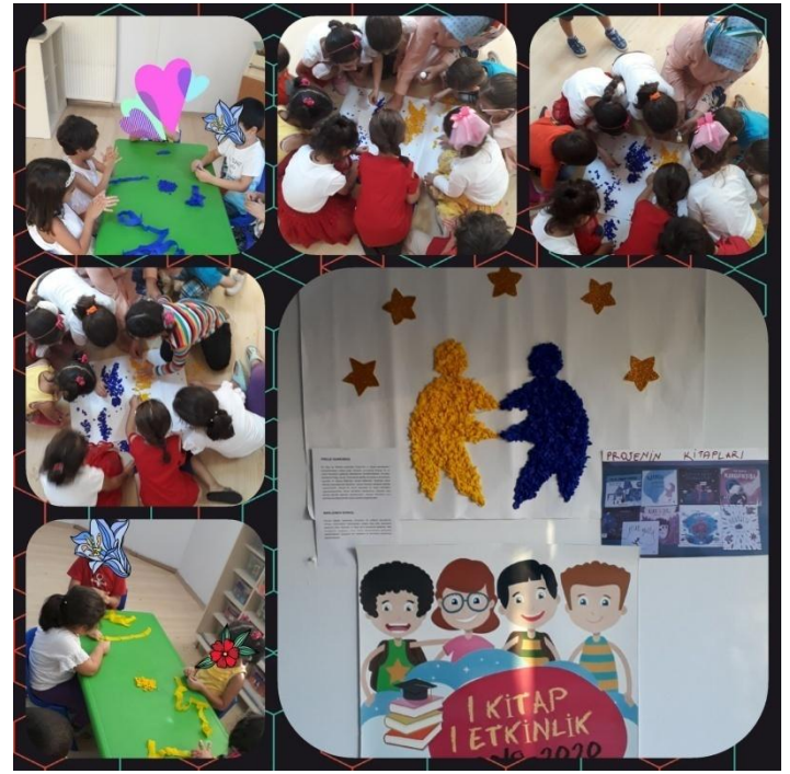
E twinning school