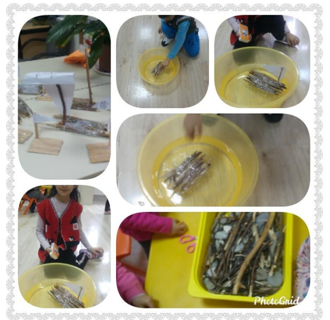
The study of "Stik man" story book