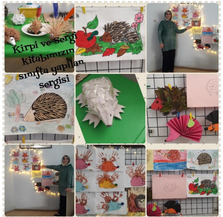
The exhibition was held about our project at class.