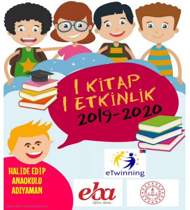
Our poster work.