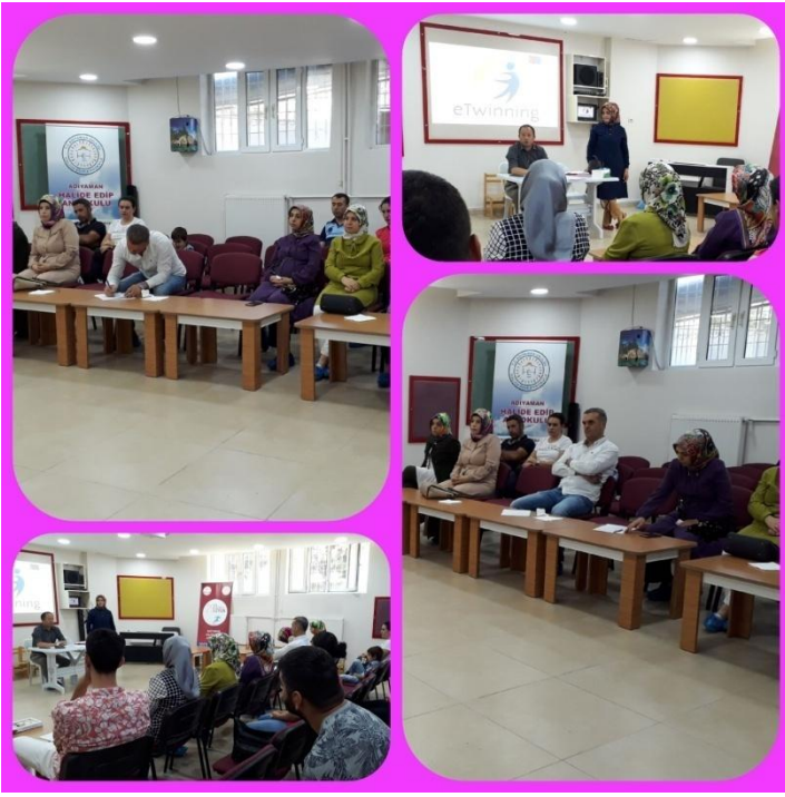
The parent informing meeting related e twinning