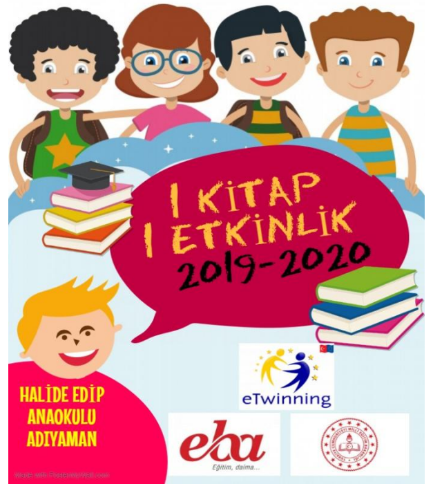
Our poster work.