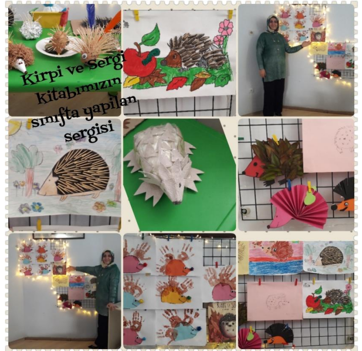
The exhibition was held about our project at class.