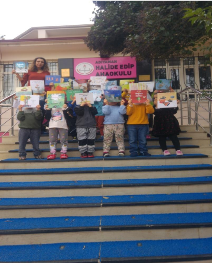
A book is a science