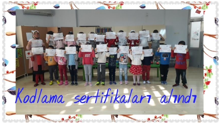
E twinnig coding certificates are taken