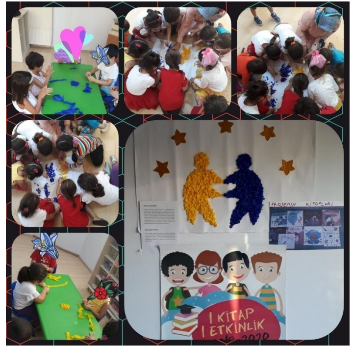
E twinning school