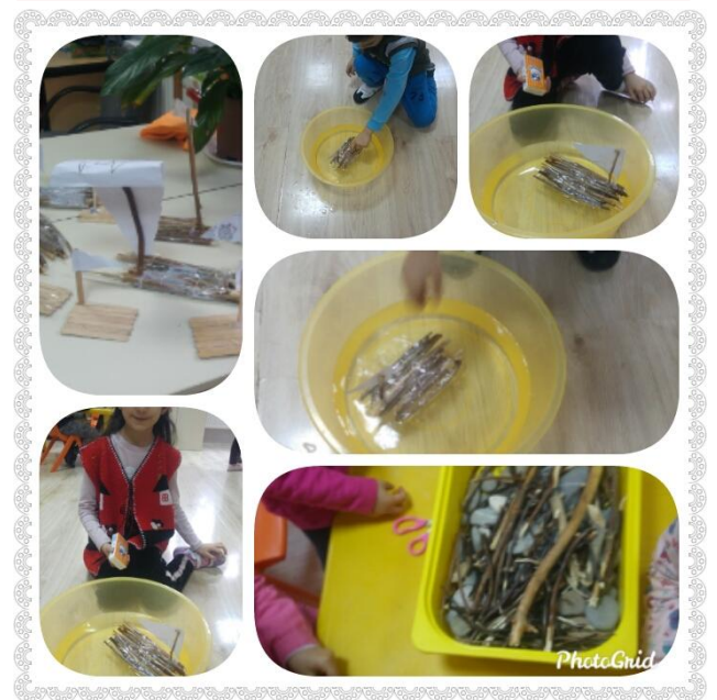
The study of "Stik man" story book