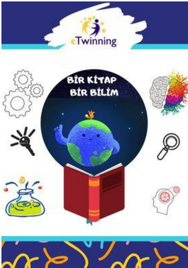
Joint poster study of our project