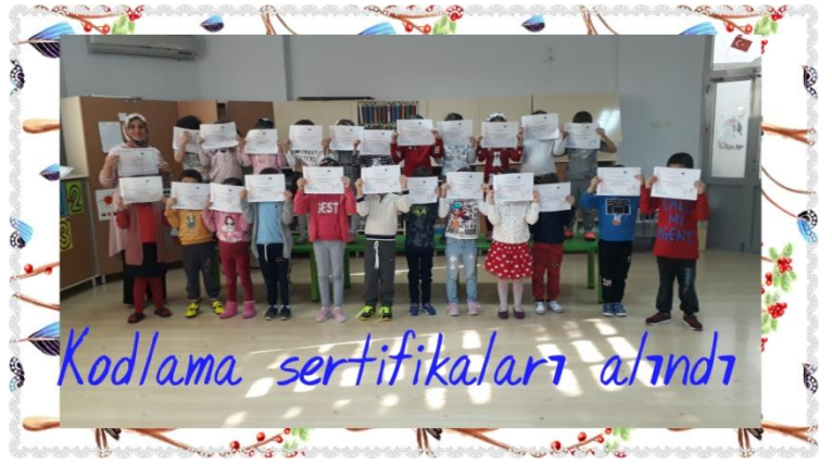
E twinnig coding certificates are taken